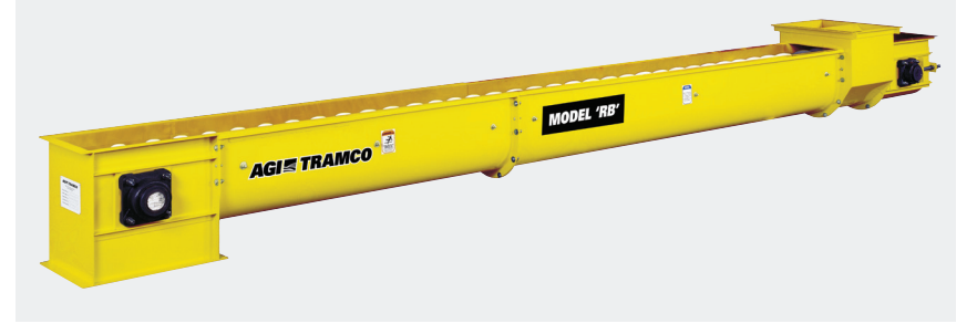
*Note: Covers have been removed for illustrative purposes only. Do not operate conveyor unless all covers, guards, etc. are in place.

Contour shaped U.H.M.W. Polyethylene Flights are standard on all AGI Tramco Model RB Conveyors for self-cleaning and quiet operation including the use standard CEMA sizes for the troughing.