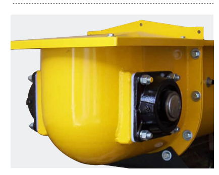
Standing flange hipped roof cover, fastened with cadmium plated bolts