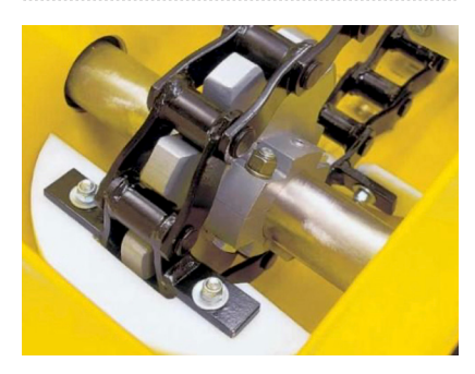
Flame hardened split sprocket for easy replacement