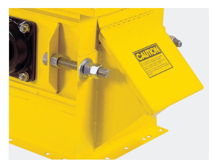
Take-up on the head with self-cleaning tail