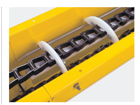
Heavy-duty, heat treated chain supported by our standard center return rail