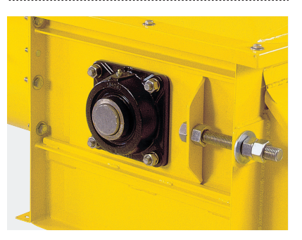
3 mil Powder Coat Finish U.H.M.W. dust seal