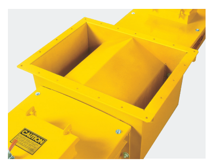
Bypass feed inlet allows feed to flow around return flight and travel directly to bottom run without damage to material