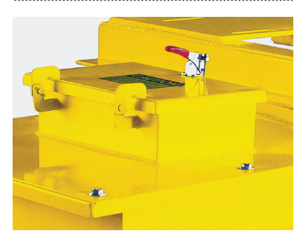
Inspection doors at each feed inlet or per customer's requirements