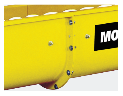
Standard totally bolted construction with grade 5 cadmium plated bolts