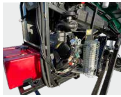
MOTOR & UPGRADED DRIVE COMPONENTS

Use this conveyor on all commodities including oil seeds with confidence. This model uses a belt brush, two belt scrapers and the turbo clean wash system, all of which were designed to keep debris off your belt and make cleanout easier than ever.